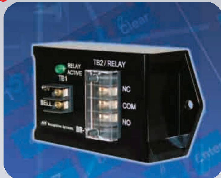
5V HandReader Relay