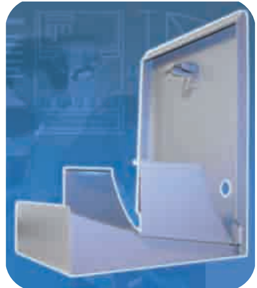
Table-Top Secure Mount for F-Series