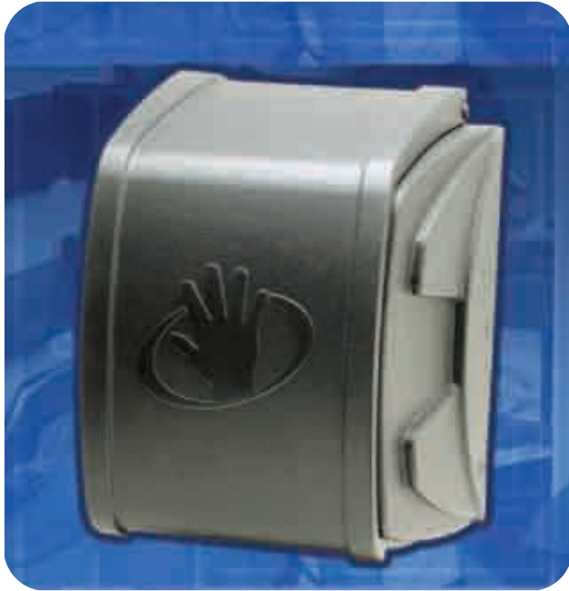
Hurricane Outdoor Enclosure