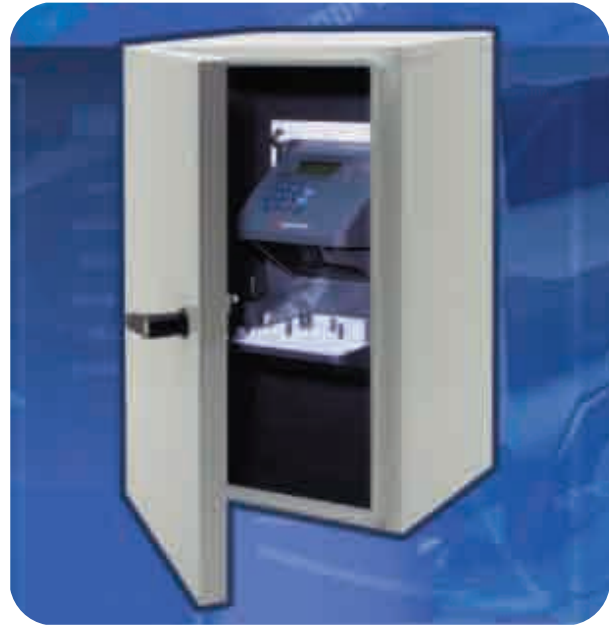
Tsunami Water Tight Enclosure