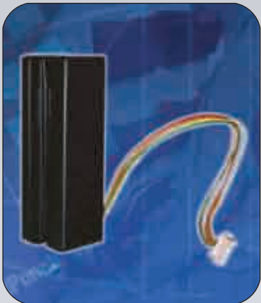
Magnetic Stripe Reader