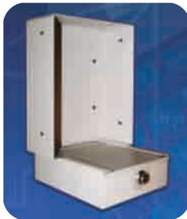
Recessed Wall-Mount Kit for E-Series