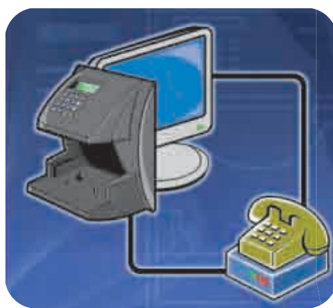
Internal Modem, 14.4K Baud