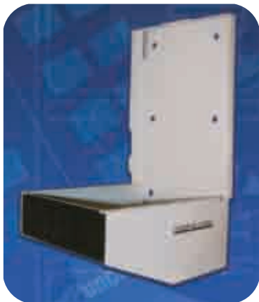
Surface Wall-Mount Kit for E-Series