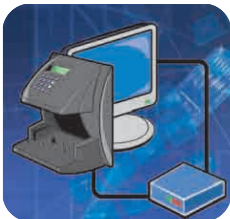
Ethernet Communications Module, 10 Base-T TCP/IP